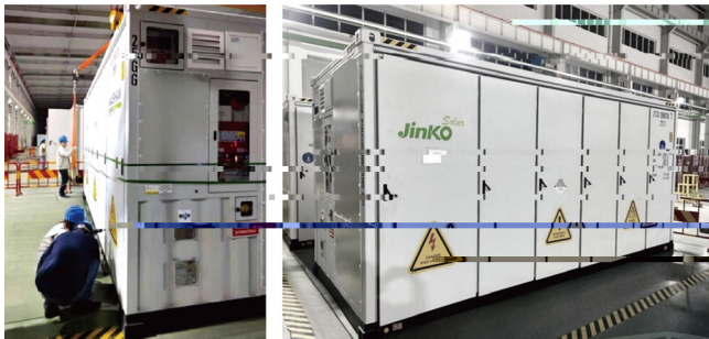
Figure 1: Project Photos

JinkoSolar' s energy storage battery cabinets are an integrated high-energy density, long-lasting, battery energy storage system. Each battery cabinet includes an IP67 battery rack system, battery management system (BMS), fire suppression system (FSS), thermal management system, and auxiliary distribution system. It is manufactured to be an install-ready and cost-effective part of the total on-grid, hybrid, off-grid commercial/industrial, or utility-scale battery energy storage system.